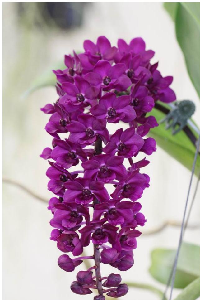
Grand Champion: Rhy. gigantea 'Red' Owned by; Allan Hughes